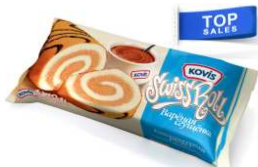
Boiled condensed milk