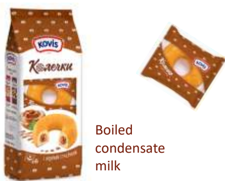
Boiled condensate milk