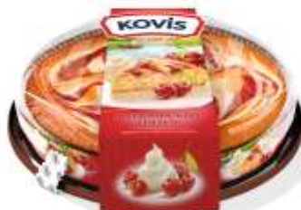
Cherry with cream