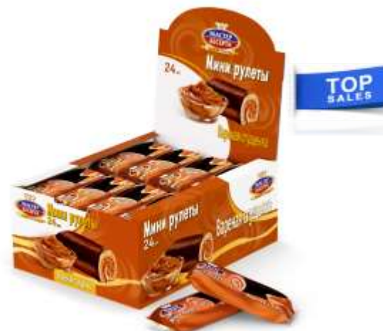
Boiled condensed milk