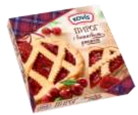
with cherry jam