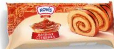
Boiled condensed milk