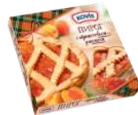
with apricot jam