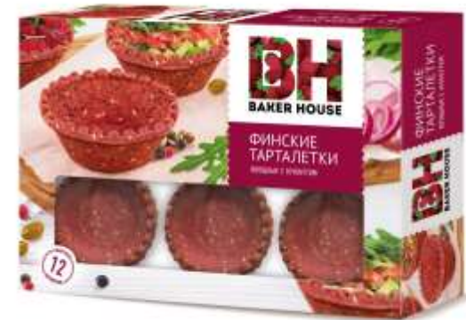
Finnish vegetable tartlets with sesame

The unique recipe of short pastry combined with assorted herbs: dill, parsley, onion combined with sea salt.