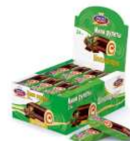
Chocolate and nut