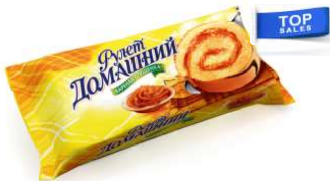
Boiled condensed milk