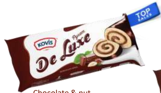
Chocolate & nut