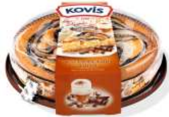
Chocolate - caramel cream