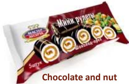
Chocolate and nut

The delicate taste of biscuit with cream and jam is the perfect dessert at home and at work.