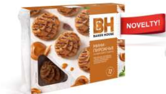
Boiled condensed milk

Delicious mini-cakes are a unique product for the Russian market that has no analogues. Stylish packaging with a transparent window and a convenient format of cakes favorably highlight the product on the shelf.