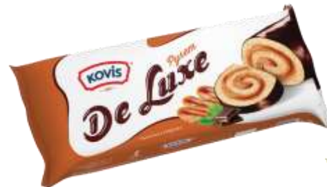
Boiled condensed milk