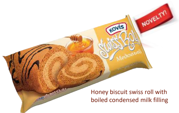
Honey biscuit swiss roll with boiled condensed milk filling

Following the taste preferences, we present the FIRST honey swiss roll in Russia under the TM Kovis Swiss Roll