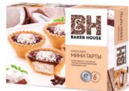
Coconut and chocolate

A classic shortbread dough with a unique and delicate filling will take you to the Gastronomic height!