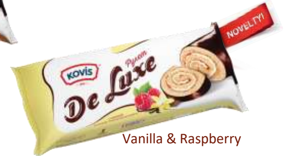
Vanilla & Raspberry