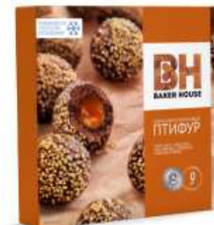
Caramel and peanut