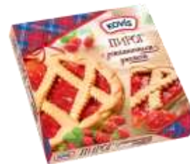
with strawberry jam