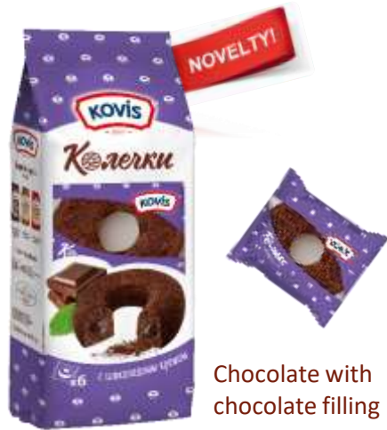
Chocolate with chocolate filling