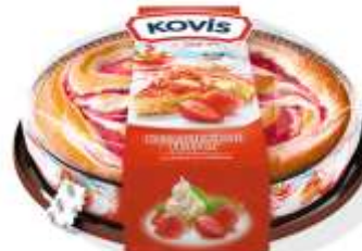
Strawberry with cream