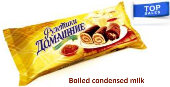
Boiled condensed milk