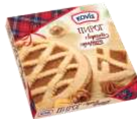
with boiled condensed milk

The classic combination of ingredients: traditional shortbread dough and traditional fillings - delicious, like in childhood!