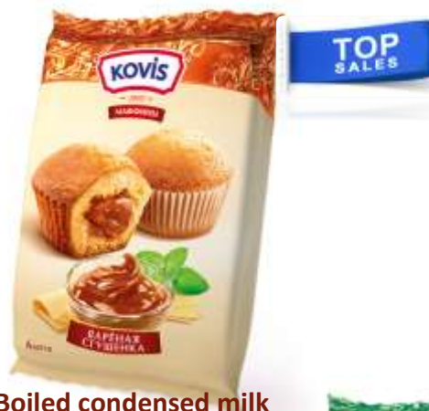
Boiled condensed milk