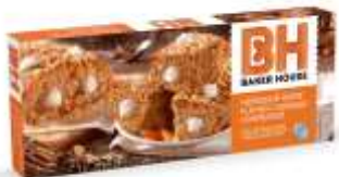
Cinnamon Meringue Pie