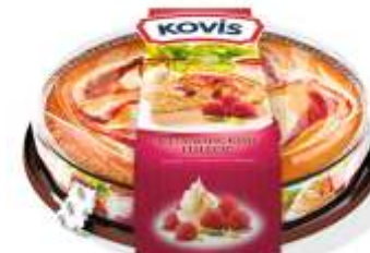
Raspberry with cream