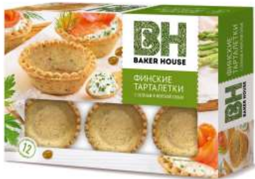
Finnish tartlets with herbs and sea salt

Today the Finnish tartlets available in two flavors: