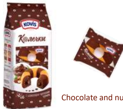
Chocolate and nuts