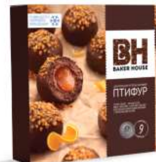
Chocolate and orange