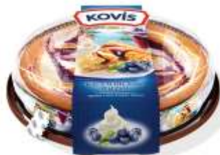
Blueberries with yoghurt cream