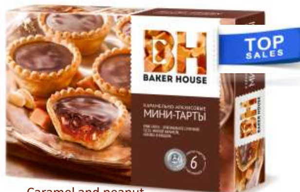
Caramel and peanut