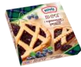
with blueberry jam