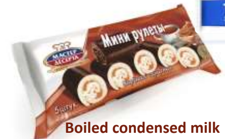
Boiled condensed milk